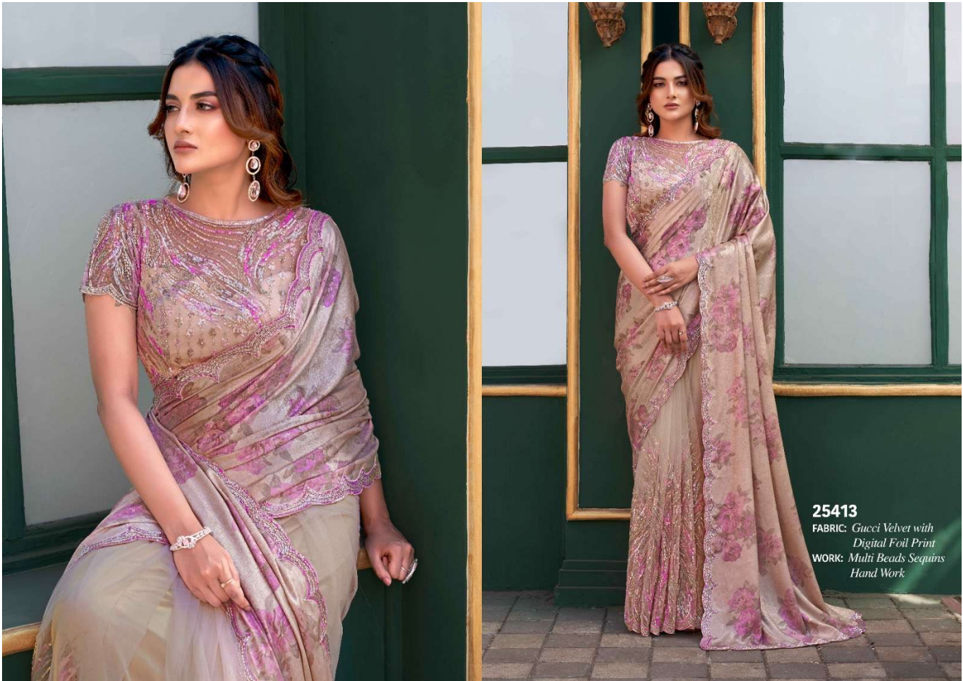
25413 FABRIC: Gucci Velvet with Digital Foil Print WORK: Multi Beads Sequins Hand Work