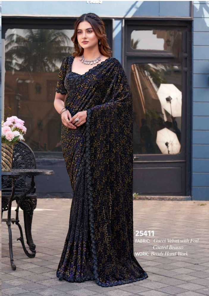
25411 FABRIC: Gucci Velvet with Foil Coated Brasso WORK: Beads Hand Work