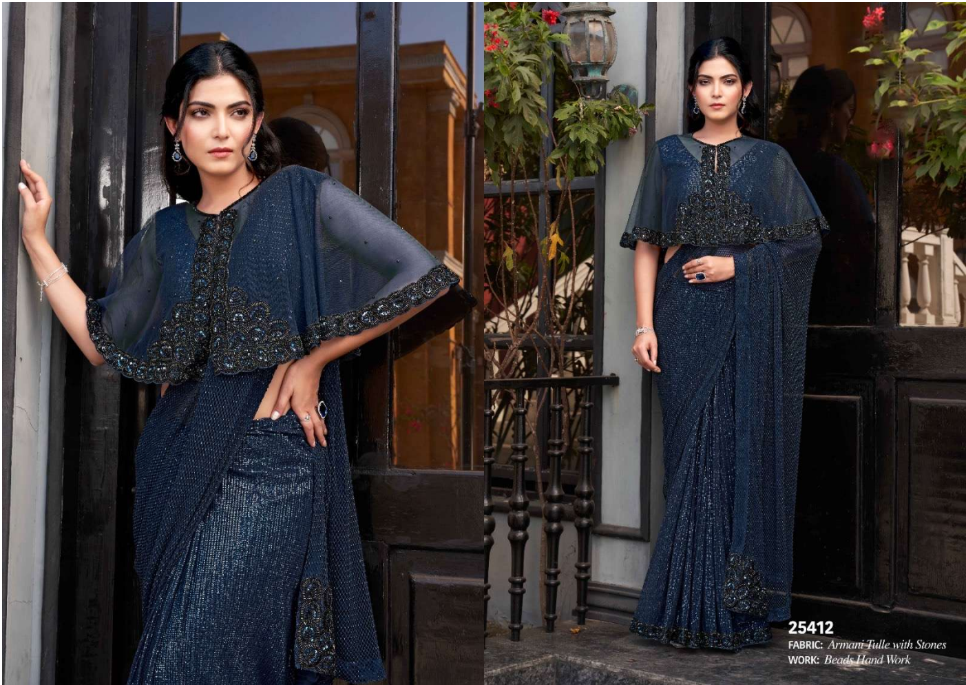
25412 FABRIC: Armani Tulle with Stones WORK: Beads Hand Work