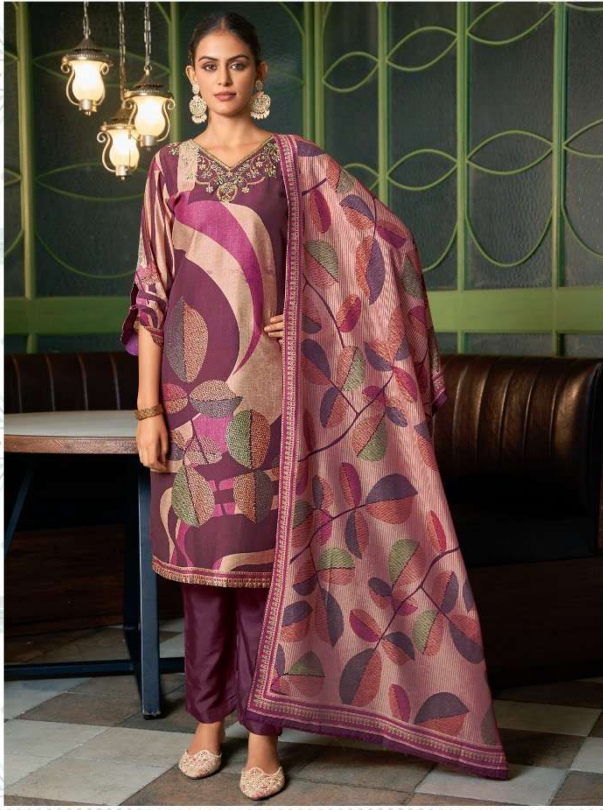
Indian Fashion Salwar Kameez and Kurtis are all the way comfortable, yet elegant and easy to wear. Designer Kurtis, Salwar Kameez and Charidar are the latest trend in Indian fashion. Some are embellished with gorgeous cutwork or work in pleating designs. They manage to look smart enough to wear for casual family gatherings, or even for a wedding ceremony.