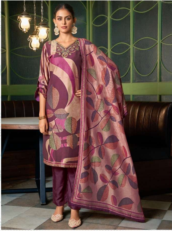
Indian Fashion Salwar Kameez and Kurta are all the way comfortable, yet elegant and easy to wear. Designer Kurta, Salwar Kameez and Chanderi are the latest trend in Indian fashion. Some are embellished with gorgeous cutwork or work in pleating designs. They manage to look smart enough to wear for casual family gatherings, or even for a wedding ceremony.