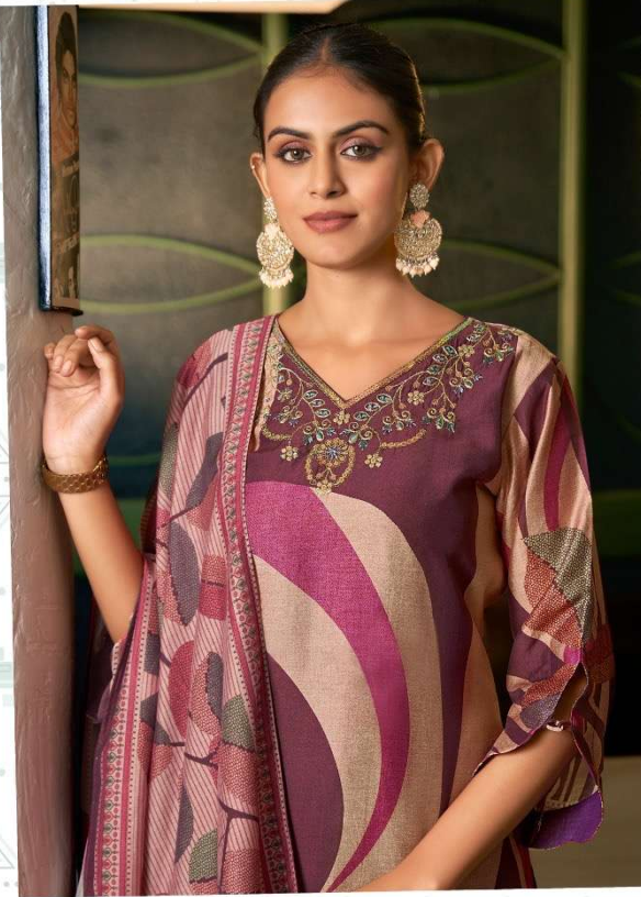
Indian Fashion Salwar Kameez and Kurtis are all the ways comfortable, yet elegant and easy to wear. Designer Kurtis, Salwar Kameez and Charidar are the latest trend in Indian fashion, some are embellished with gorgeous embroidery work in pleasing designs, they manage to look smart enough to wear for casual family gatherings, or even for a wedding ceremony.